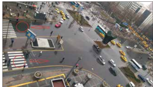
Figure 2. Picture of the start of the Kızılay Square-Ziya Gökalp street

in Çankaya, Ankara; taxis passing the Kuğulu intersection between January 20 th and 22 nd 2016; and taxis passing the Tandoğan intersection on January 23 rd 2016 at 09:00-11:00 and at 14:00-16:00. Sixty-three taxis in which the smoking status of the driver, the presence of a customer, the smoking status of the customer, the place where the customer was seated in the taxi, and the presence of a child in the taxi could not be fully assessed were excluded from the survey. As a result, analyses were conducted on 3656 taxis (Figure 1).