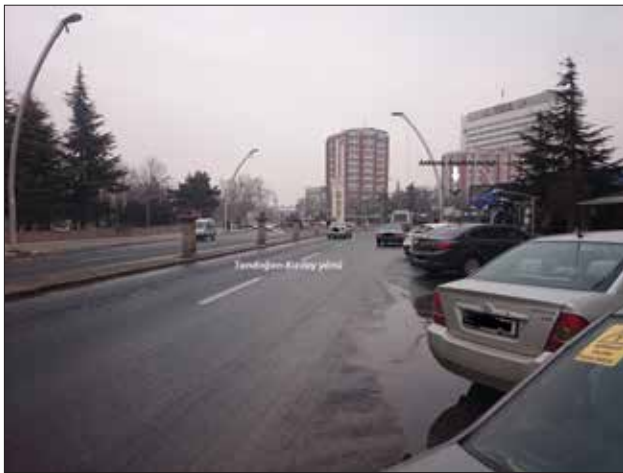
Figure 4. Picture of Tandoğan Intersection Döğol Street

A photograph of the Kuğulu intersection is shown in Figure 3. Taxis from the direction of Kızılay to the Kuğulu intersection and taxis that were moving in the direction of Kızılay from Kuğulu Park were observed.