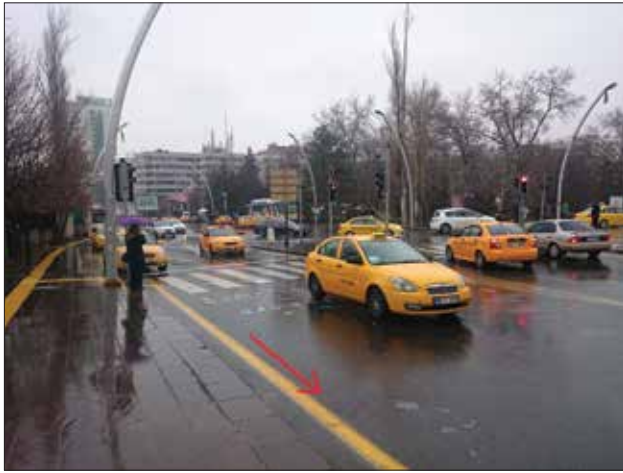
Figure 3. Picture of the Kuğulu intersection